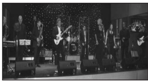
Sweetwater Orchestra "Playing Your Disco Hits"