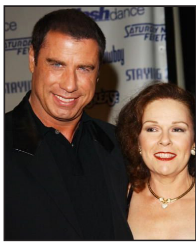
Special Appearance Karen Lynn Gorney Co-star of "Saturday Night Fever"