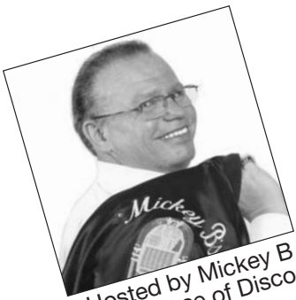
Hosted by Mickey B The Prince of Disco