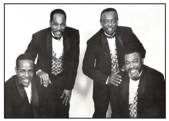
Harold Melvin's Blue Notes "The Love I Lost"