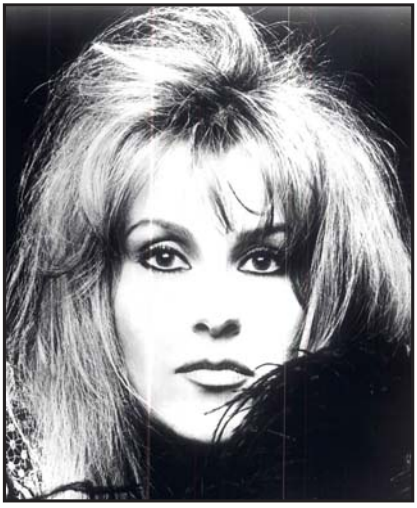
France Joli "Come To Me"